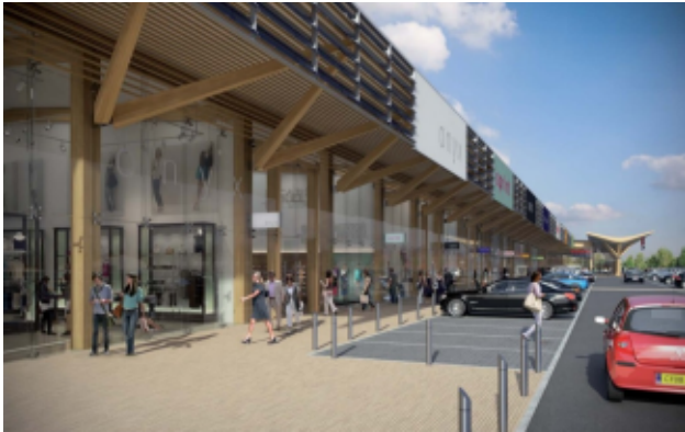
Computer visualisation of new retail units

Land Securities, the owners of the Bishop Centre, presented proposals for the redevelopment of the Centre at an exhibition on 8 and 9 July. Several articles and letters about the proposals have appeared in the Maidenhead Advertiser . The essence of the proposals is to demolish the existing 36 shops and to build a 30,000-sq-ft supermarket at the end of a long row of various sizes of shops, each with a mezzanine floor. Parking will be increased from 397 to 439 car spaces plus 96 cycle parking stands. Land Securities have planning permission in place for 95,000 square feet of retail space and for an additional access to the A4. These proposals indicate that it will be seeking an increase to 131,000 square feet.