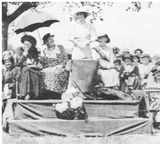
Nancy Astor and Sara Roosevelt at the rally

Just before World War Two, Nancy hosted the Triennial Conference of the Associated Country Women of the World (ACWW) at Cliveden. 300 delegates were present. The National Federation of Women's Institutes were founder members of the ACWW. A second rally was held at Cliveden in 1965 hosted by