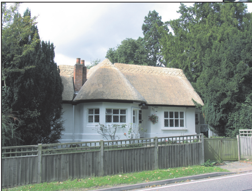
The finished product - a tribute to British craftsmanship